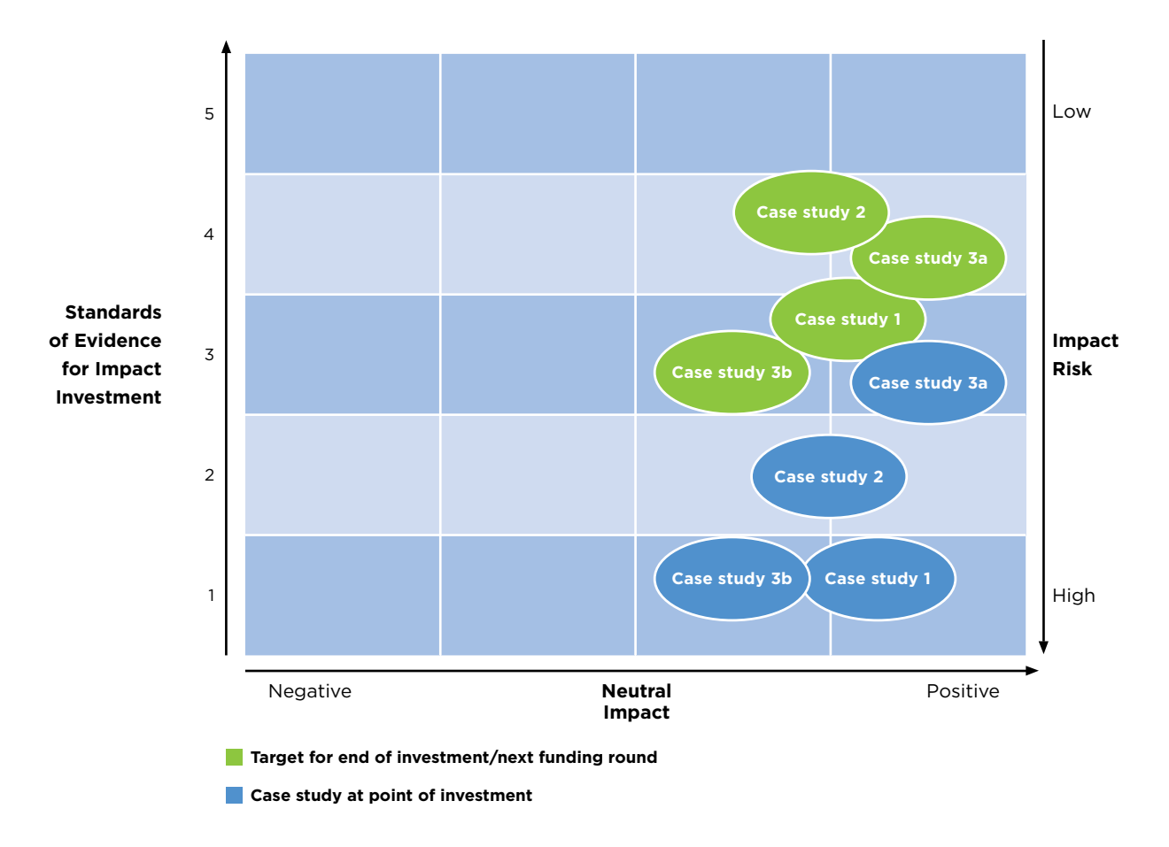
Figure 2: Example progress of investees