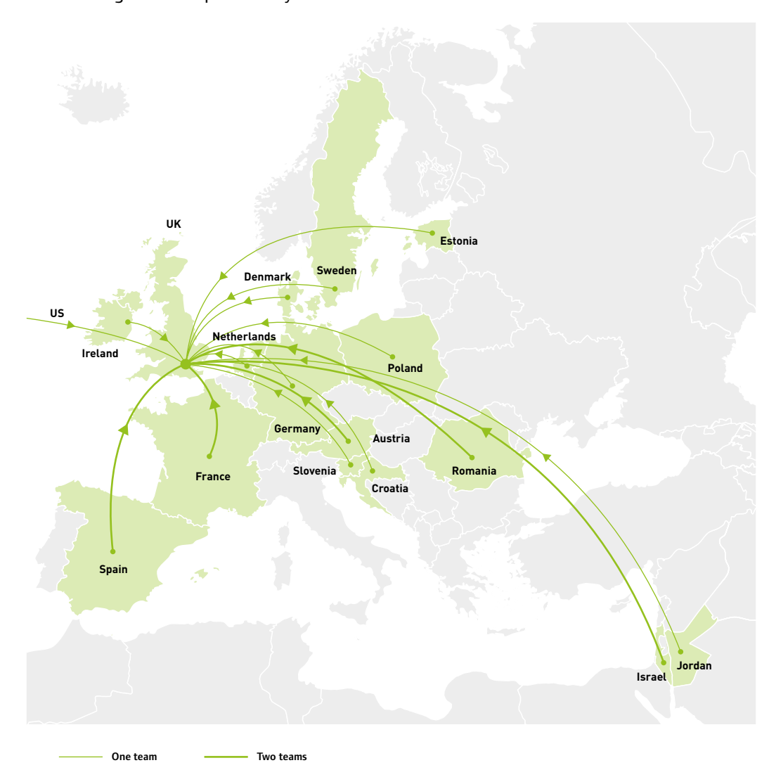
Figure 3: In addition to 13 UK-based teams, seedcamp companies have been attracted from throughout Europe and beyond